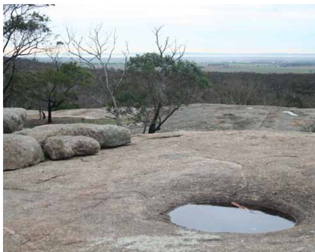
Aboriginal water wells in the granite rocks