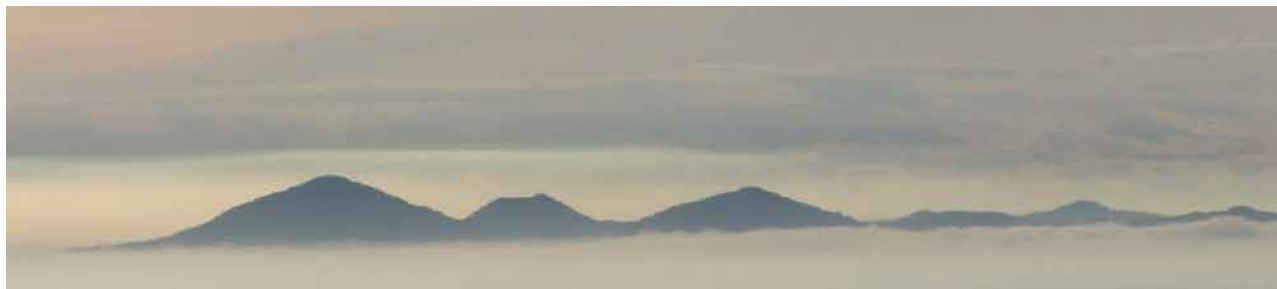
You Yangs in Fog

A detailed significance assessment is provided over the following pages.