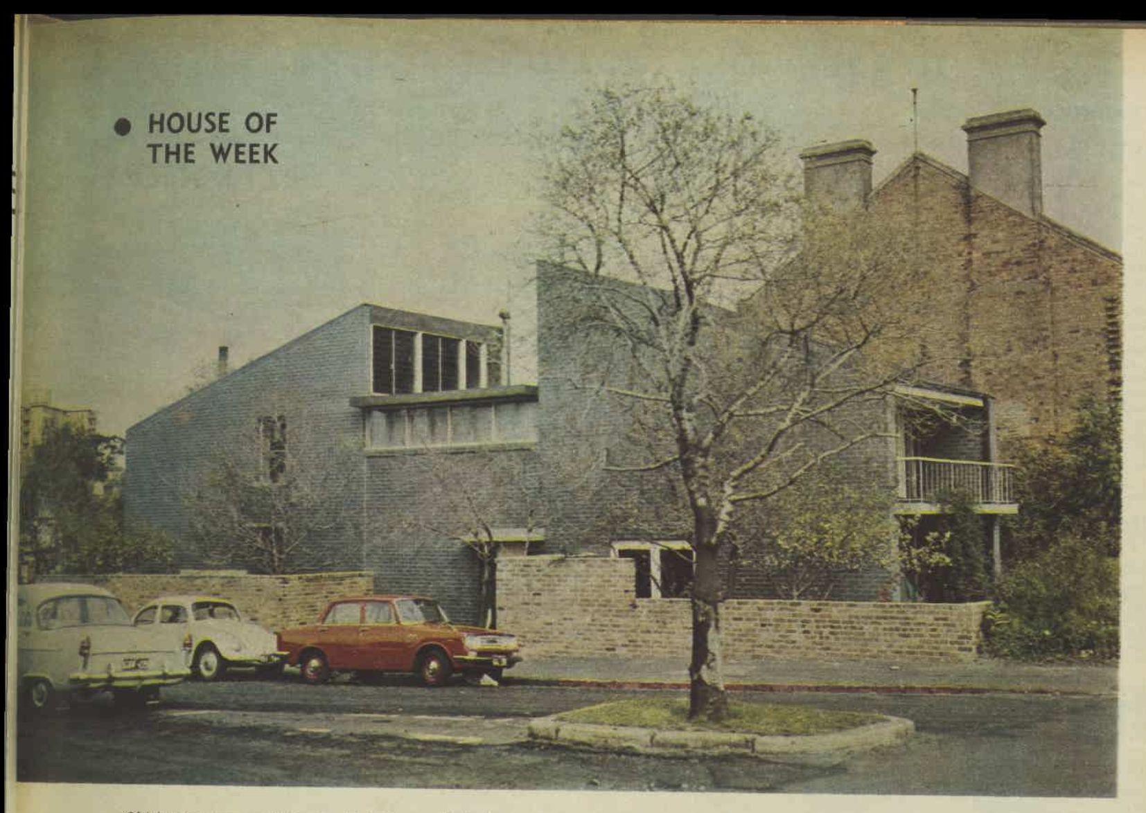
Old bricks were used for the high fence which gives privacy to two tiny courtyards. Only breaks with convention on the outside of the house are the side entrance instead of a front one and the interruption in the sloped slate roof, which allows for extra windows.