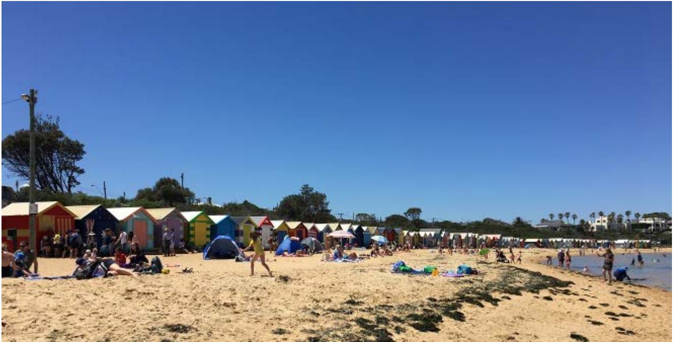
2017: Dendy Street Beach Bathing boxes, looking south