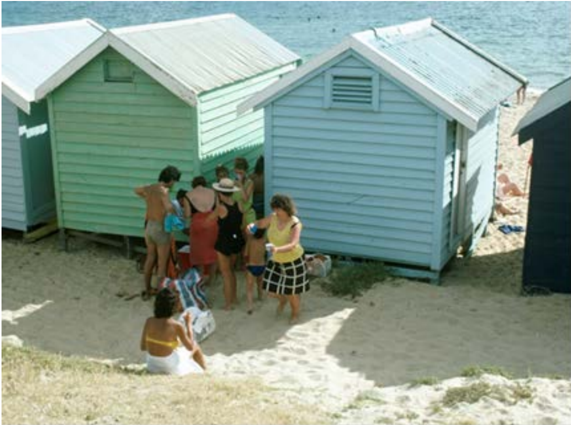
1987: Rear of the Dendy Street Bathing Boxes