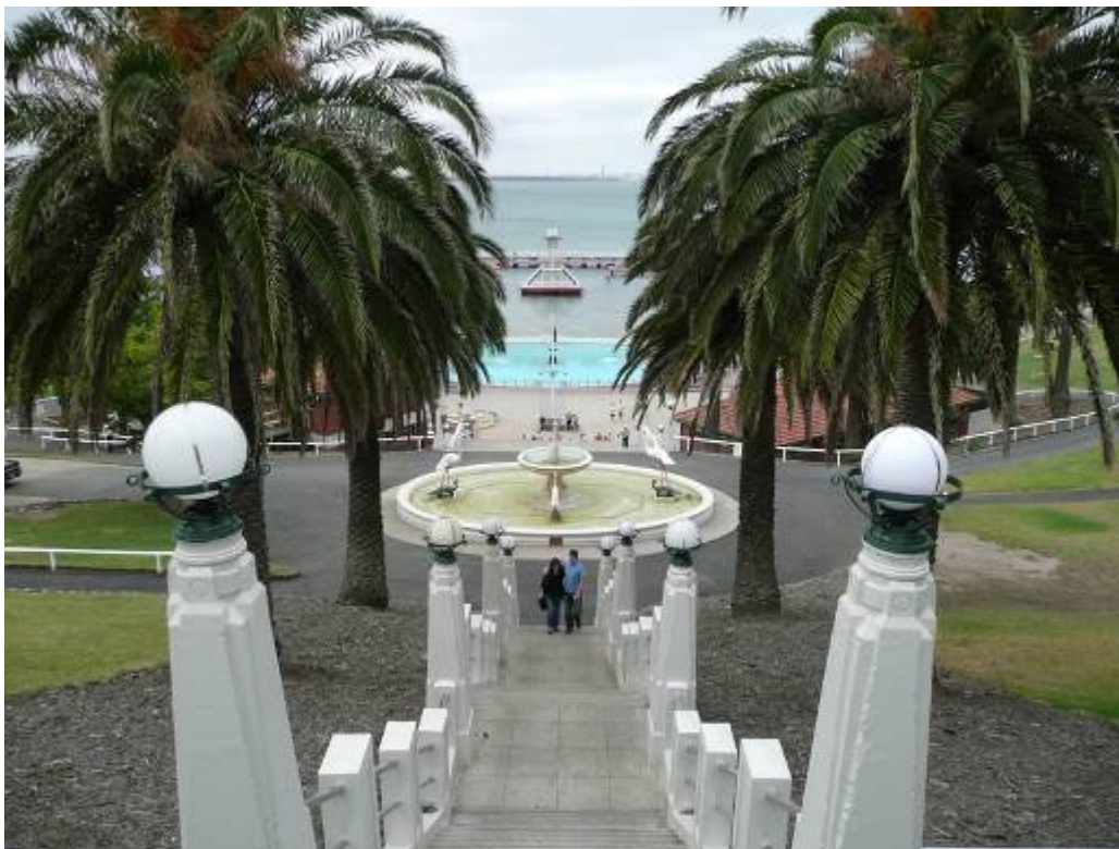
Eastern Beach Bathing Complex And Reserve (VHR H0929)

Constructed between 1928 and 1939, the Eastern Beach Bathing Complex is the last major enclosed sea bathing facility to be constructed on Port Phillip Bay, and represents the culmination of the ethos of sea bathing. Eastern Beach has provided a focal point for Geelong’s outdoor activities. Eastern Beach Promenade is also significant in being the only original structure that survives of the many sea-baths which once dominated Port Phillip Bay’s foreshore and is unique within Victoria. Eastern Beach represents an innovative example of the work of structural engineer and architect, Harry Hare. The sea-baths are illustrative of the traditional pastime of sea bathing, popular since the 1840s and are representative of the transition from segregated and private bathing in the 19th century to mixed public bathing and pursuit of sport and leisure in the early 20th century. There were no bathing boxes at Eastern Beach Bathing Complex and Reserve.