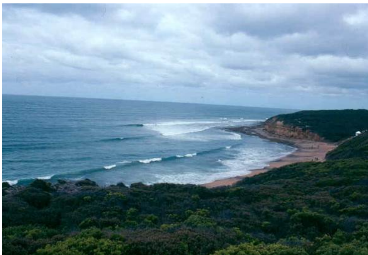
Bells Beach Surfing Recreation Reserve (VHR H2032)

Bells Beach Surfing Recreation Reserve is a landscape that is significant as an international icon of Australian surfing culture. It comprises a high concentration of quality surfing spots created by swells from the southern ocean which slow and steepen over the reef strewn shallows to form consistent, rideable waves. The roots of surfing in Victoria are in the Torquay/Surf Coast area beginning at Lorne in 1920, and pioneer surfers were accessing Bell's Beach from 1939. In January 1961 the first surfing event was held, followed by the first annual Bells Beach Easter competition in 1962 which, since 1991, has been recognised as the world's longest running surfing competition. The creation of the Bells Beach Surfing Recreation Reserve (a world first) in 1973, the recognition of its environmental excellence, and even the creation of the Surf Coast Shire in 1995 bear testimony to the special place of surfing and Bells Beach in Victorian social history. Bells Beach Surfing Recreation Reserve has historic significance to the development of surfboard and wetsuit technology. The Bells Beach conditions led to important developments in the surfing industry which has become a multi-million dollar surf manufacturing industry. There were no bathing boxes at Eastern Beach Bathing Complex And Reserve.