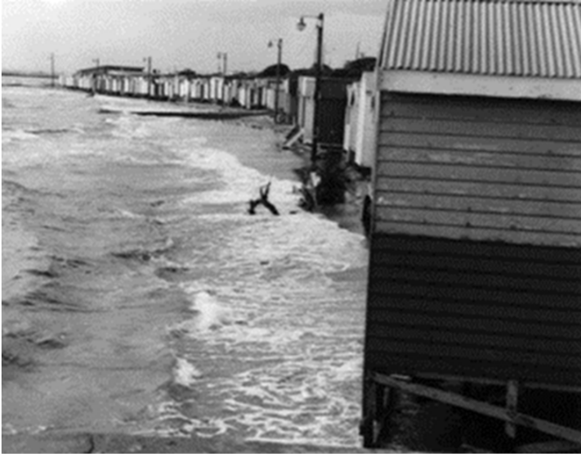
1980: King Tide at Dendy Street