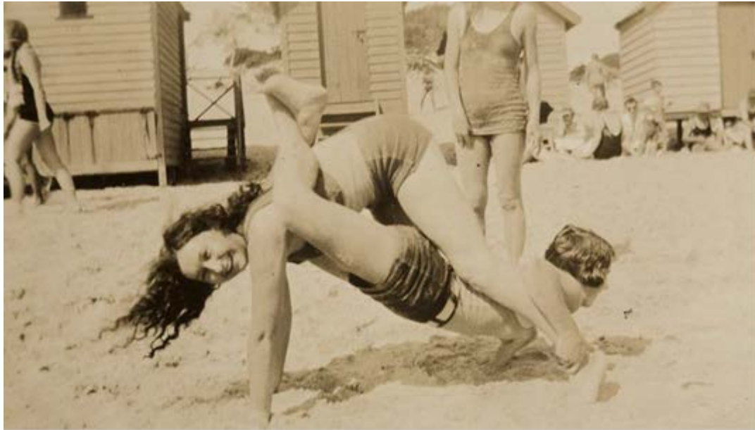
c1932 Dendy Beach