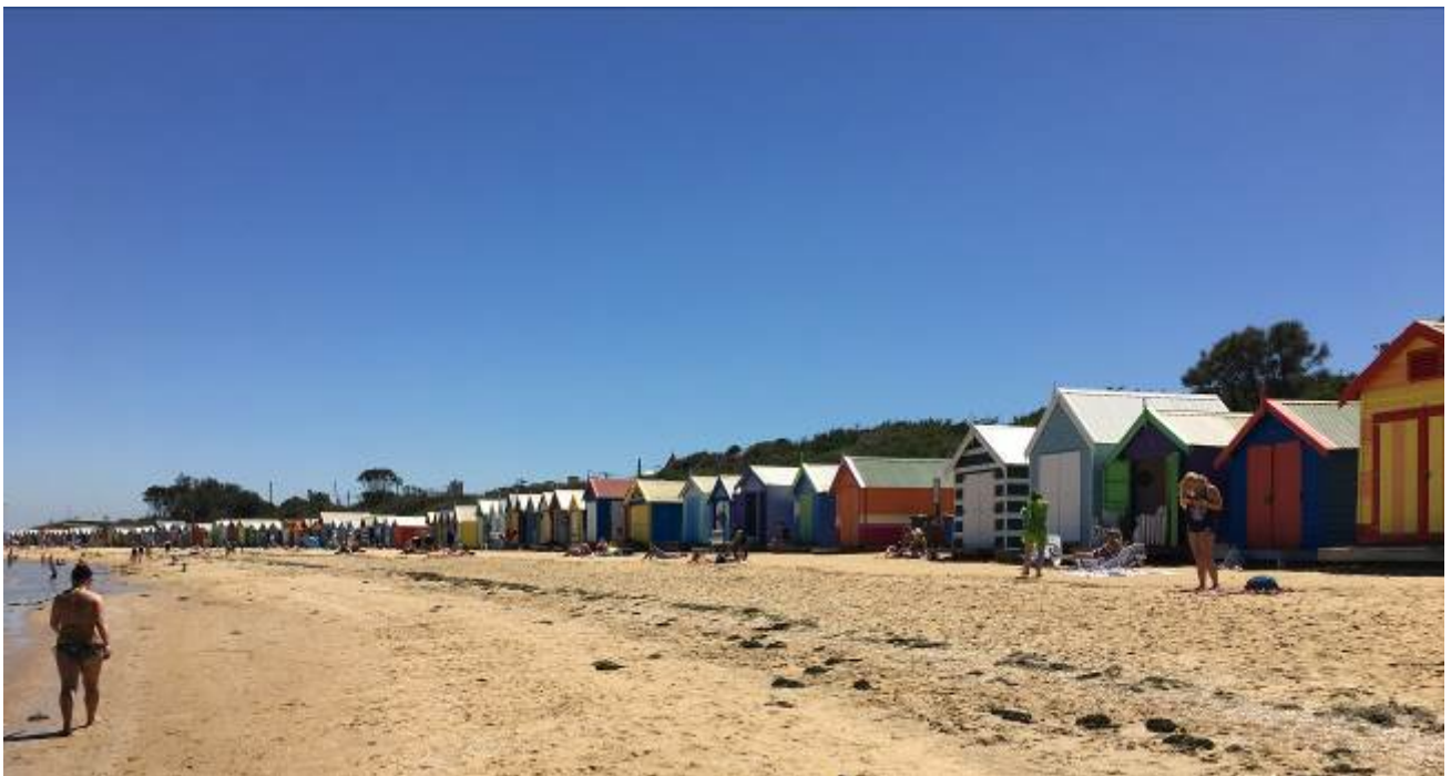
2017: Dendy Street Beach Bathing boxes, looking north