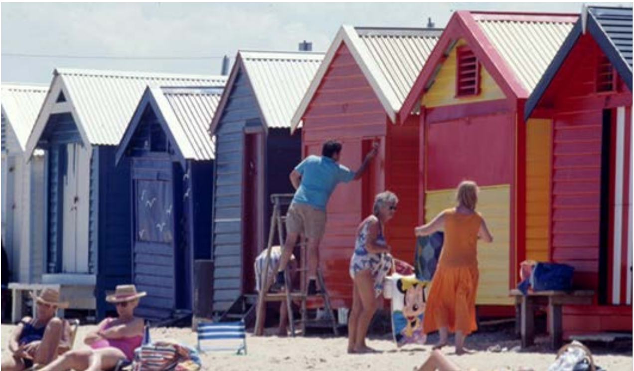
1980s: Dendy Street Beach