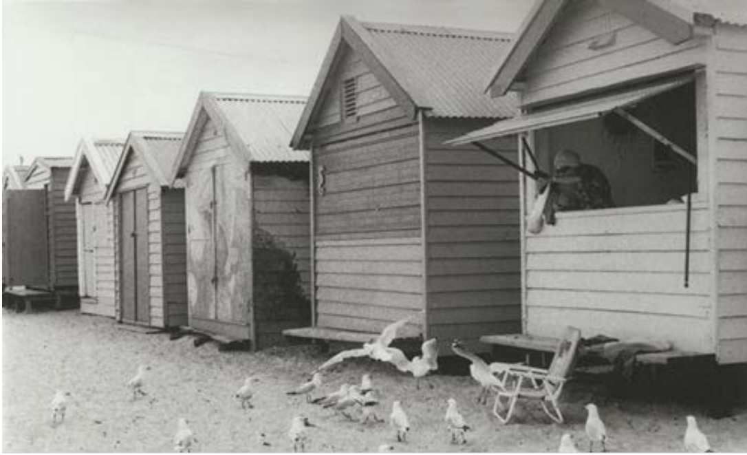
1951: Bathing boxes Brighton Beach