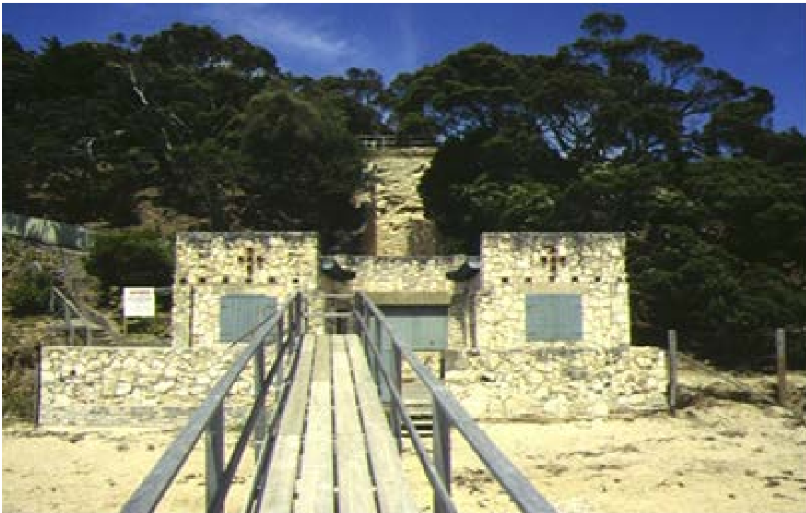
Ilyuka Lime Kiln / Bathing Box (VHR H1191)