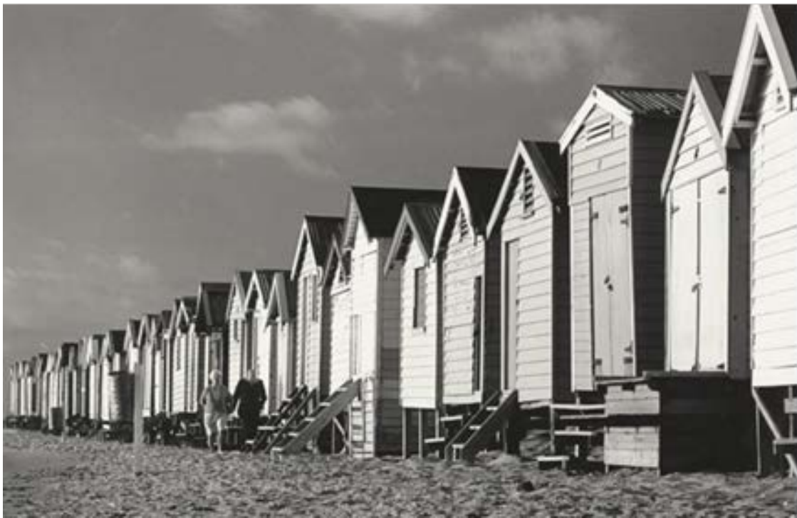
1961: Brighton