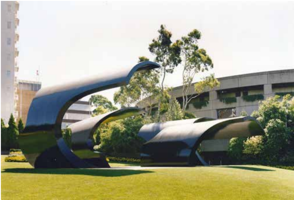
Fig. 1: Forward Surge , c. 1981, photograph by Mark Strizic courtesy Inge King.