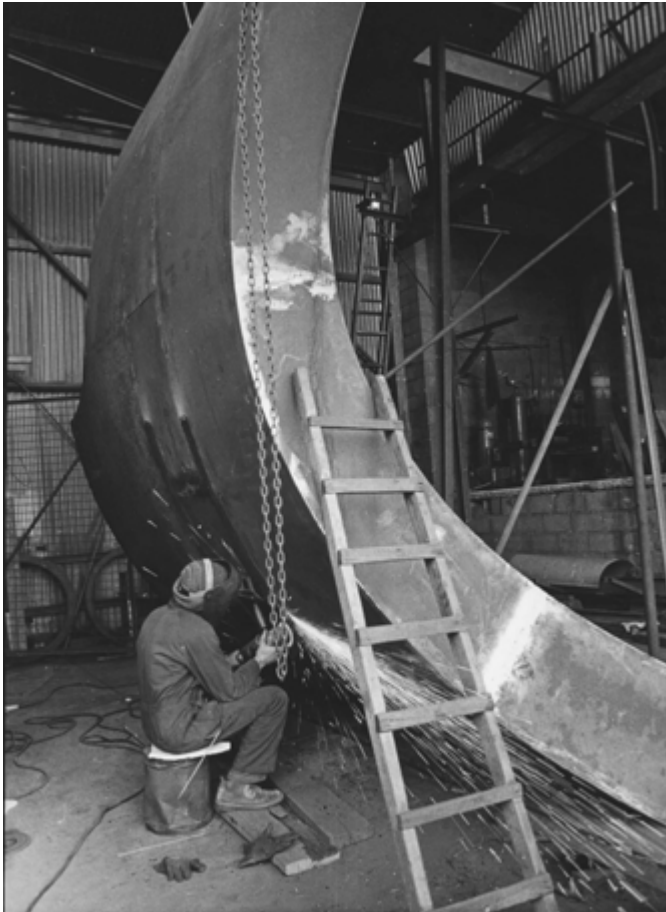
Fig. 5: Forward Surge under construction, 1975-6, photograph by Grahame King courtesy Inge King, artist's papers, folder 14.