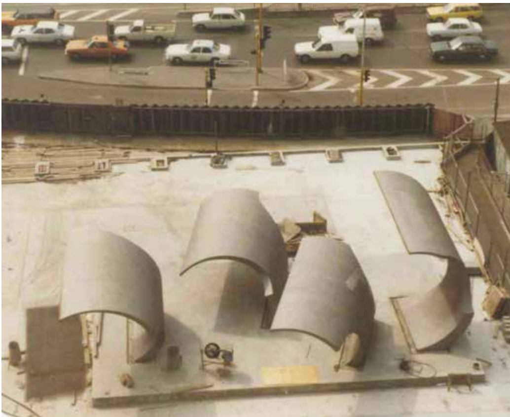
Fig. 8: Forward Surge during installation, prior to painting, showing extent of concrete foundations, 22 March 1981, photograph courtesy J.K. Fasham's.