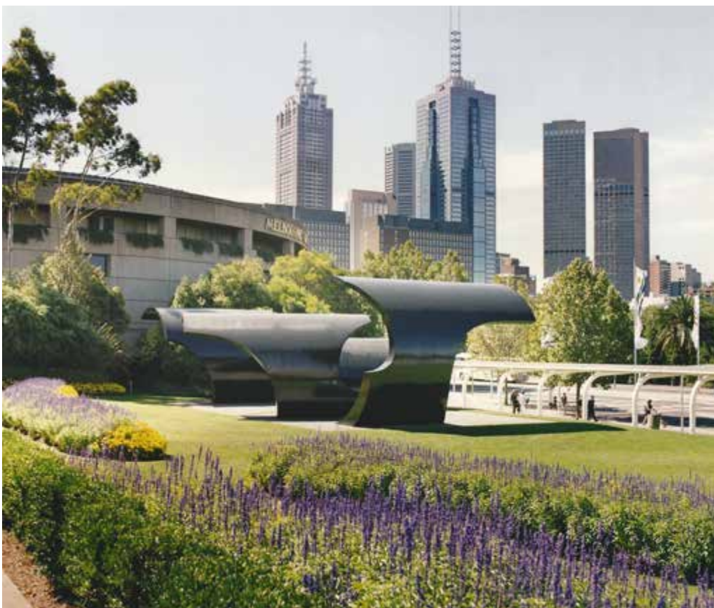
Fig. 2: Forward Surge , c. 1981, photograph by Mark Strizic courtesy Inge King.