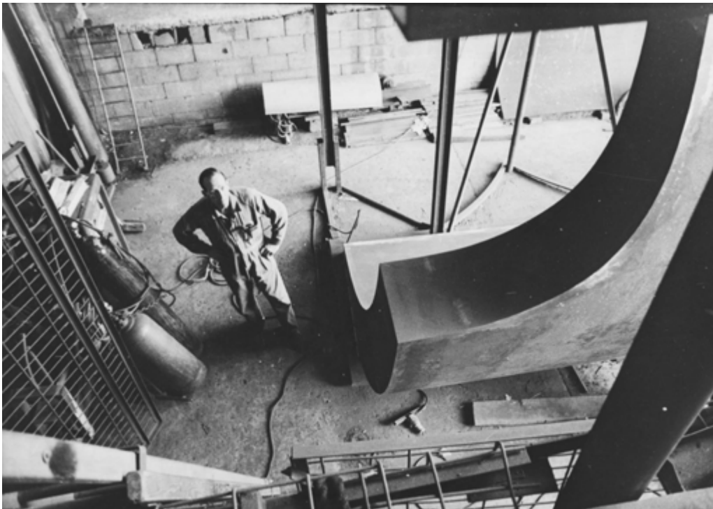
Fig. 4: Forward Surge under construction, 1975-6, photograph by Grahame King courtesy Inge King, artist's papers, folder 14.