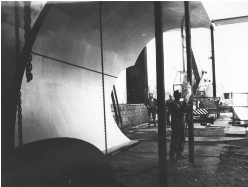
Fig. 6: Forward Surge under construction, 1975-6, photograph by Grahame King courtesy Inge King, artist's papers, folder 14.